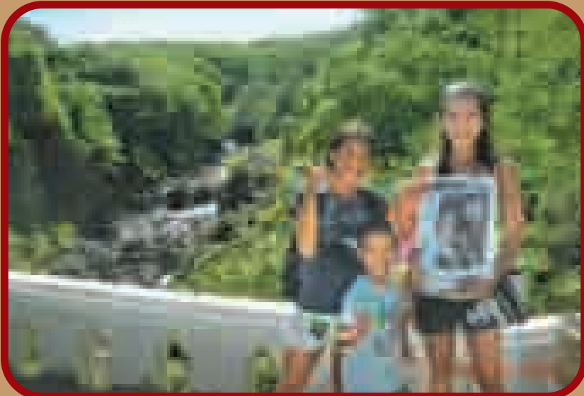
"The narrow bridge before the main entrance to the Hana sacred pools in Maui, Hawaii, is a perfect spot to pose with Alive! The drive took us three hours for a 56-mile trip, but we were rewarded with beautiful scenery along the way." - Christine Tabirara, LADBS