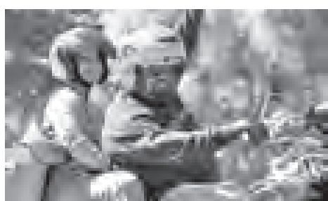
A couple heads to their destination.