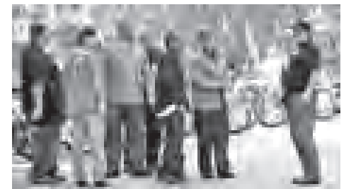
From the Sanitation West Los Angeles Yard.