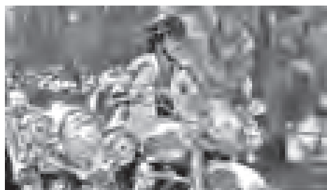
One of many solo women rolling toward her destination.