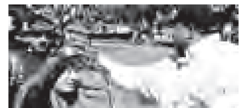
Blessing of the first bike.