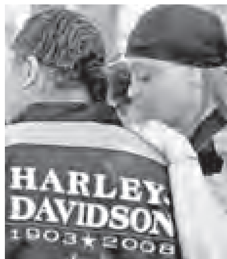
One of the many couples in attendance.