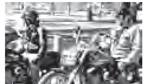
They're getting ready to have their bikes blessed.