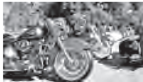
Some of the 125 bikes that participated in the Blessing of the Bikes event.