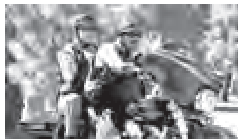
Jimmy and Sylvia.