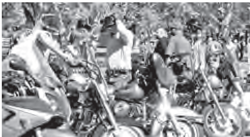
Mounting of the bikes for the blessing.