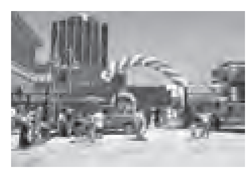
The entrance to Memorial Plaza and Museum. The Museum and Memorial are at 1355 N. Cahuenga Blvd. in Hallawood