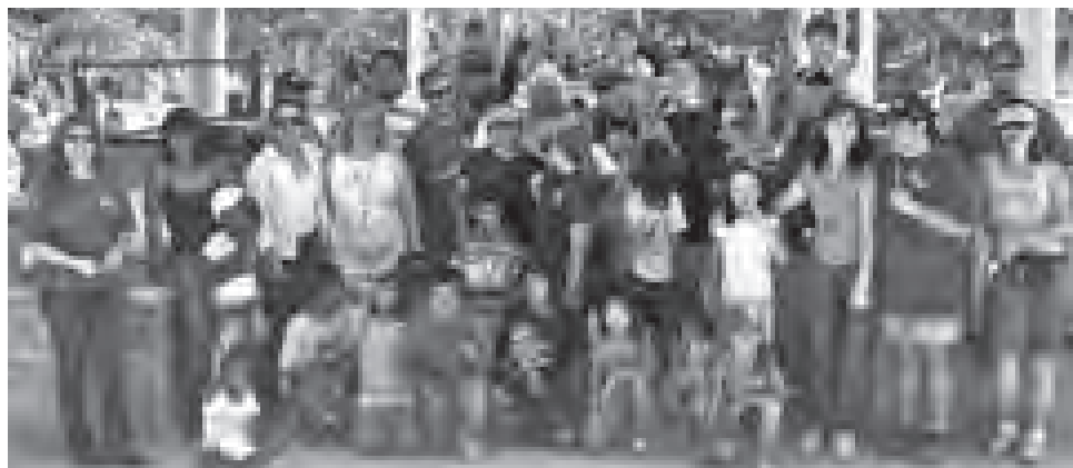
LAHD employees pose for a group photo.