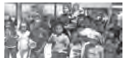
Housing kids line up for prizes.