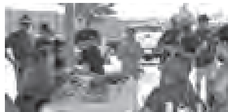
LAHD employees enjoy the picnic.