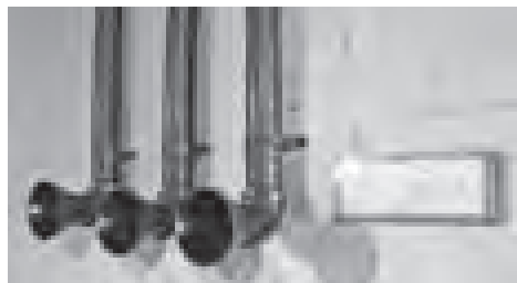
Speaking tubes that continue to work throughout the grounds.