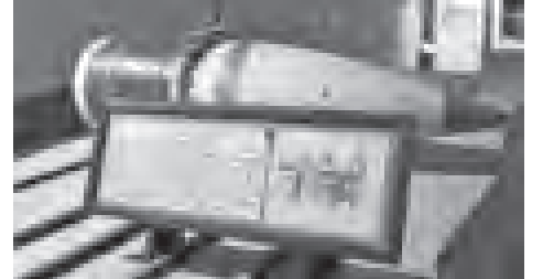
Check out that shell!