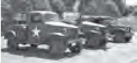
Vintage World War I and II military vehicles restored by the Fort MacArthur volunteers.