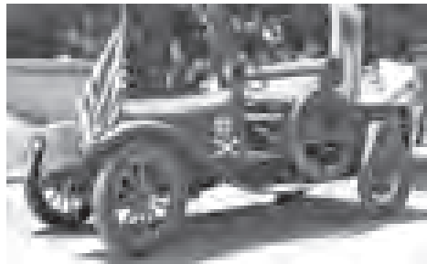
A vintage vehicle that was restored by Fort MacArthur Museum volunteers.