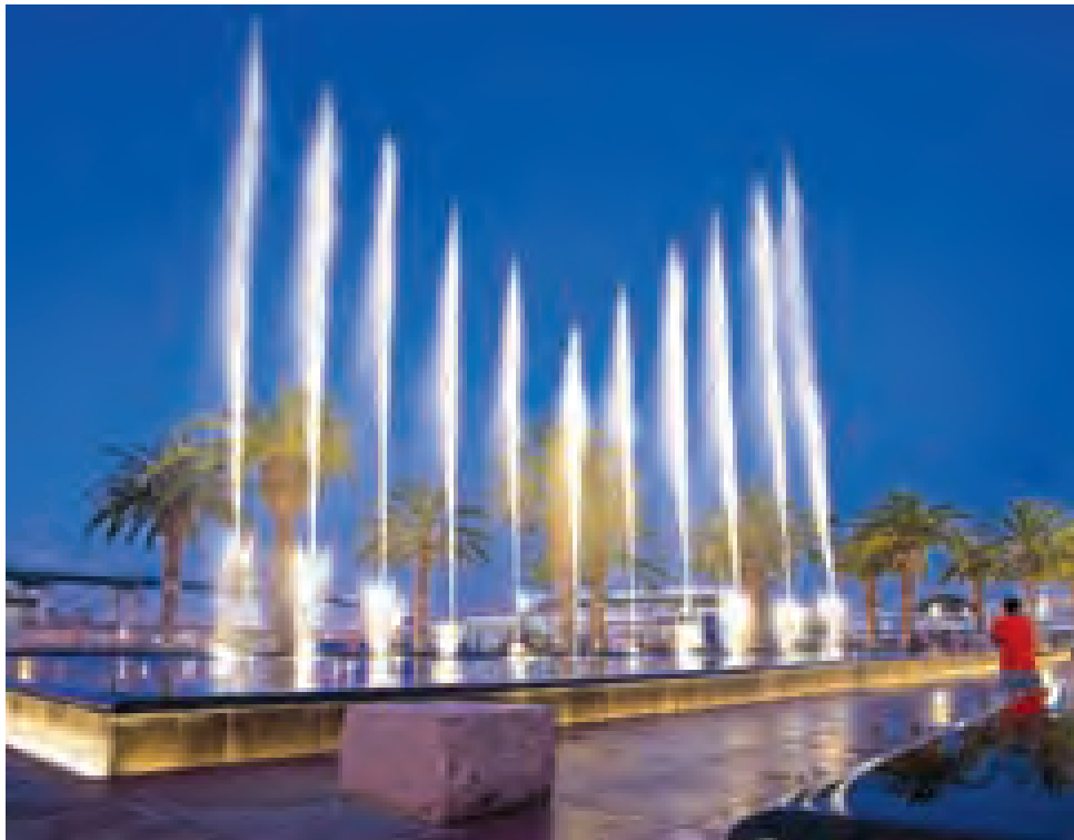
One of the new fountains at the Harbor Gateway.

location, there is no boundary between people and water, and visitors can get as wet as they like in jets that leap playfully out of the pavement. More than 20 years ago, the fountain builders, Los Angeles-based WET Design, first introduced the then-revolutionary concept of a fountain emitting directly from the ground, not a pool.