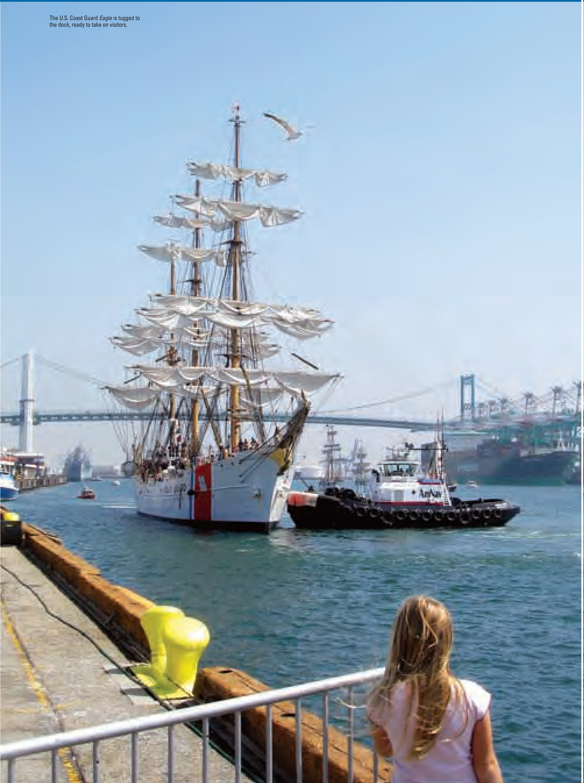
The U.S. Coast Guard Eagle is tugged to the dock, ready to take on visitors.