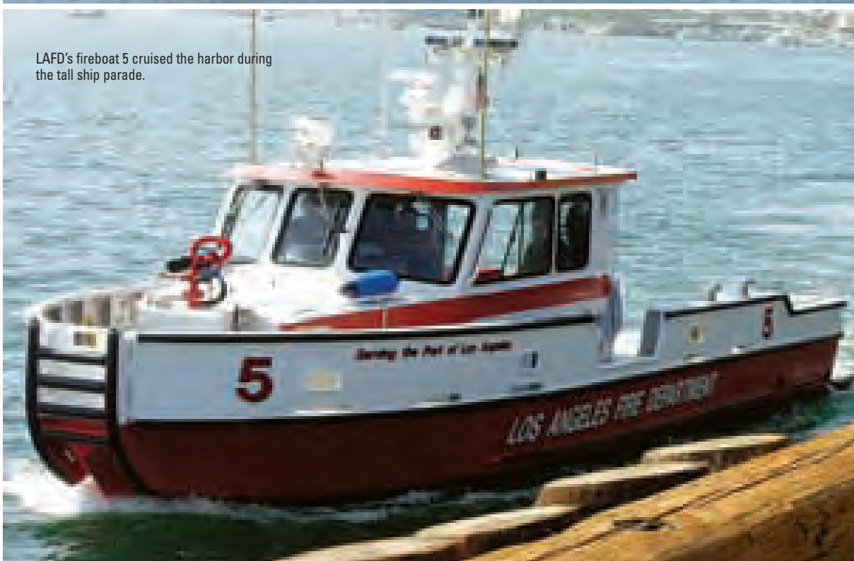
LAFD's fireboat 5 cruised the harbor during the tall ship parade.