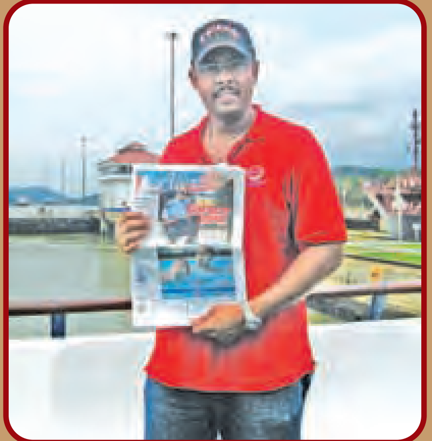
"This is a photo taken from a ship transiting the Pedro Miguel Locks in the Panama Canal. The Panama Canal is considered the Eighth Wonder of the World. I was here on vacation with my family in July. Panama is a great place to visit."