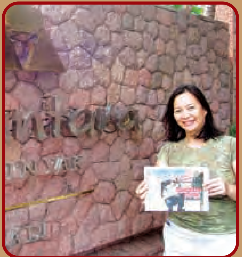
"My family and I went to Bali, Indonesia, and Kuala Lumpur, Malaysia, from July 17 to 24."