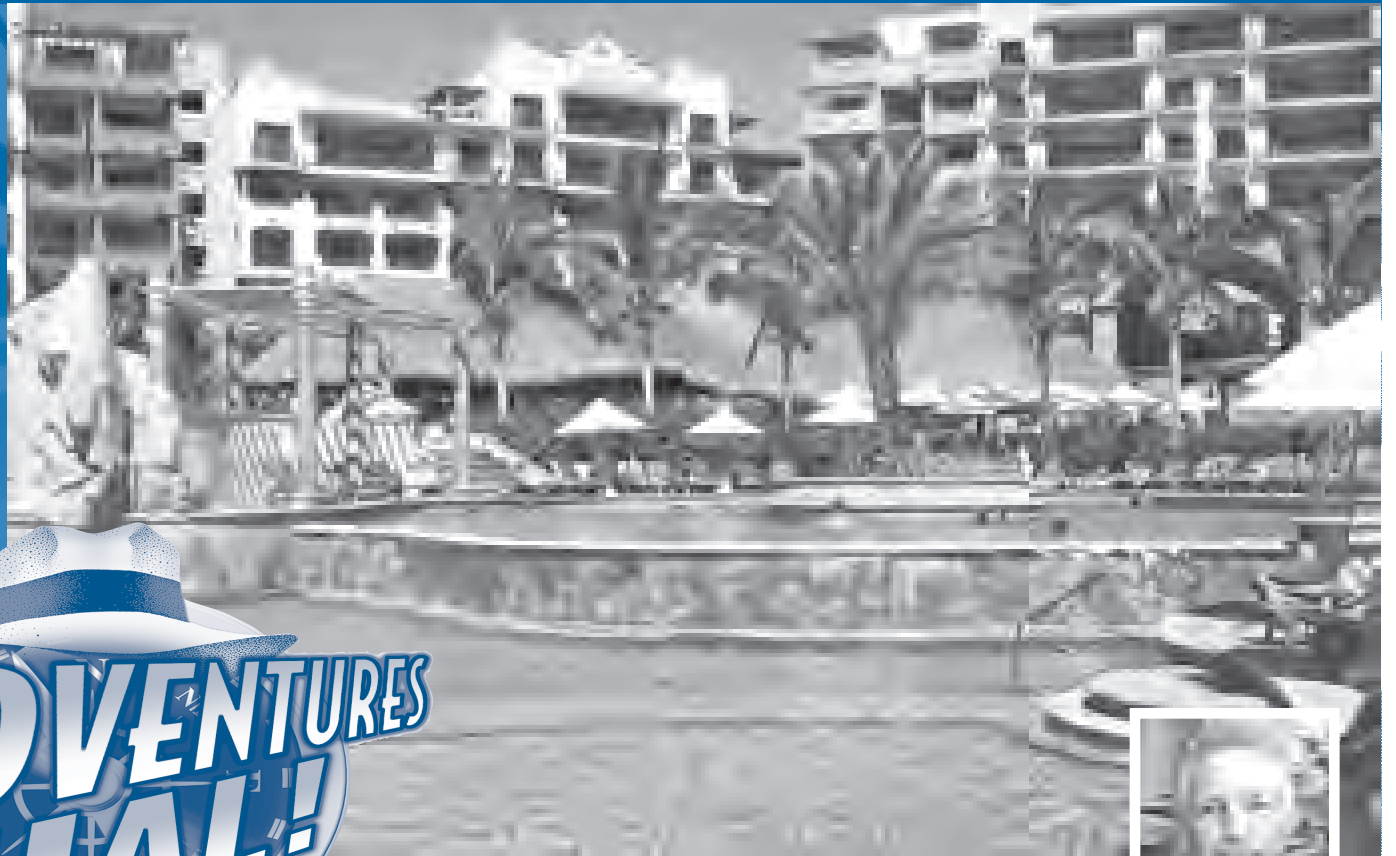
The Playa Grande Resort pool.