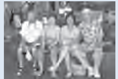
Hal, Evelyn, Effie and Pierre.

end of Cabo San Lucas, almost at the tip of the peninsula. Its beach was on the Pacific side and was not good for swimming, but with four swimming pools, it wasn't an issue. We each had a one-bedroom unit that slept five people. Each unit had two full bathrooms and a full kitchen with a purified water system. This year they added wireless Internet access. There were a number of restaurants either on the property or nearby, and there's a very good spa. We were far enough off the beaten track for it to be quiet, but close enough to walk into the main area of Cabo San Lucas.