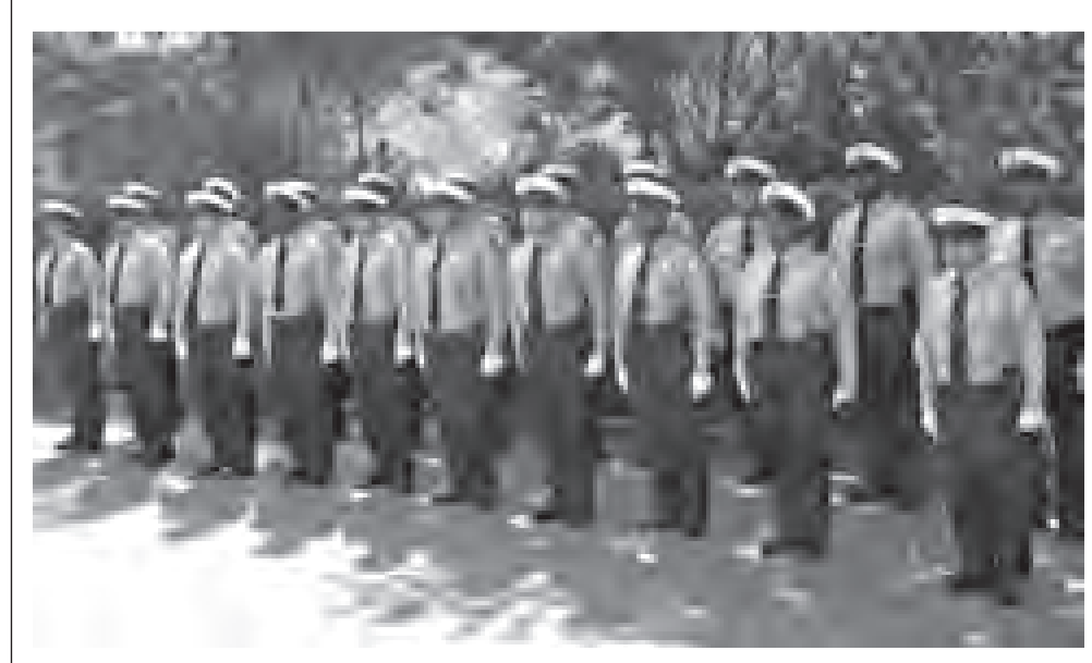
The new officers ready for graduation

Transportation graduates 20 new Parking and Traffic Officers.