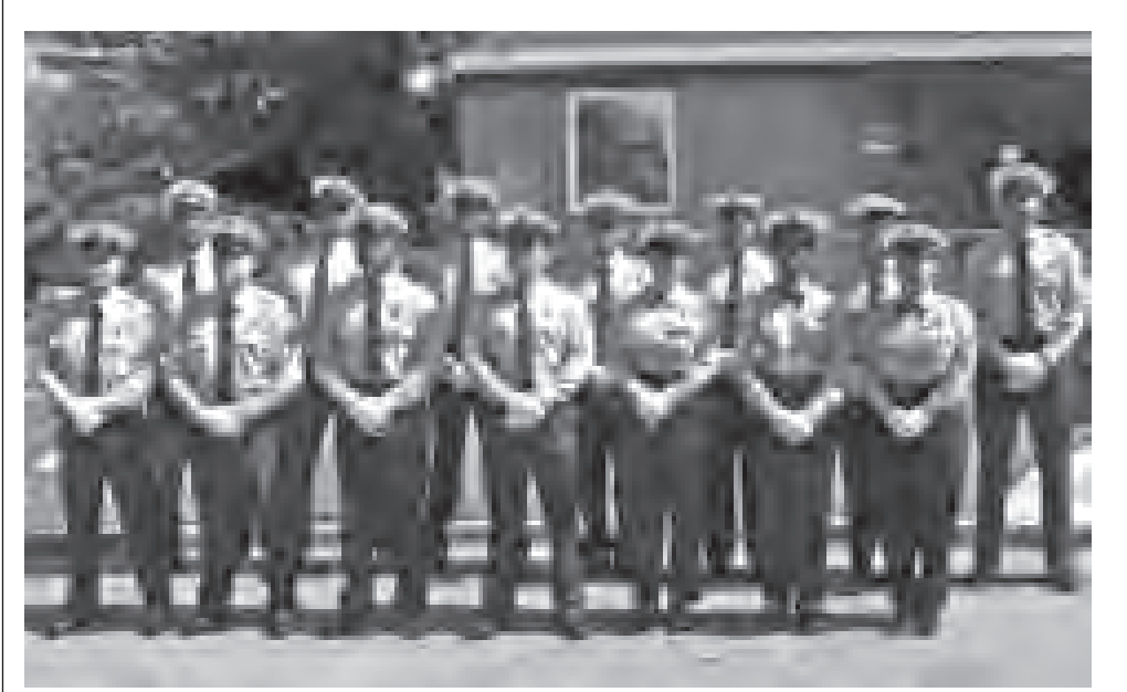
The Instructors are ready for inspection.