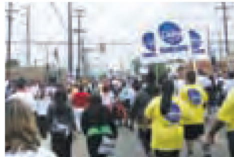
Team LAPD at the Revlon Run/Walk for Women's Cancers event May 10 near the Coliseum.