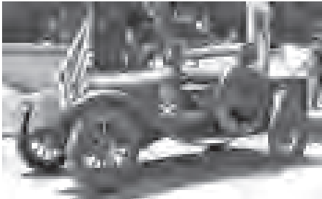
A vintage vehicle that was restored by Fort MacArthur Museum volunteers.