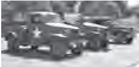
Vintage World War I and II military vehicles restored by the Fort MacArthur volunteers.