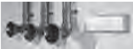
Speaking tubes that continue to work throughout the grounds.