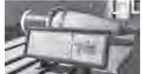
Check out that shell!