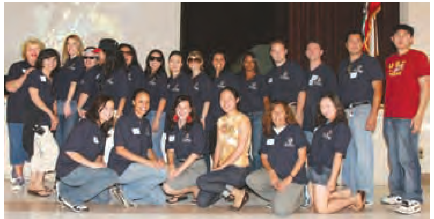
The Council District Four Staff.