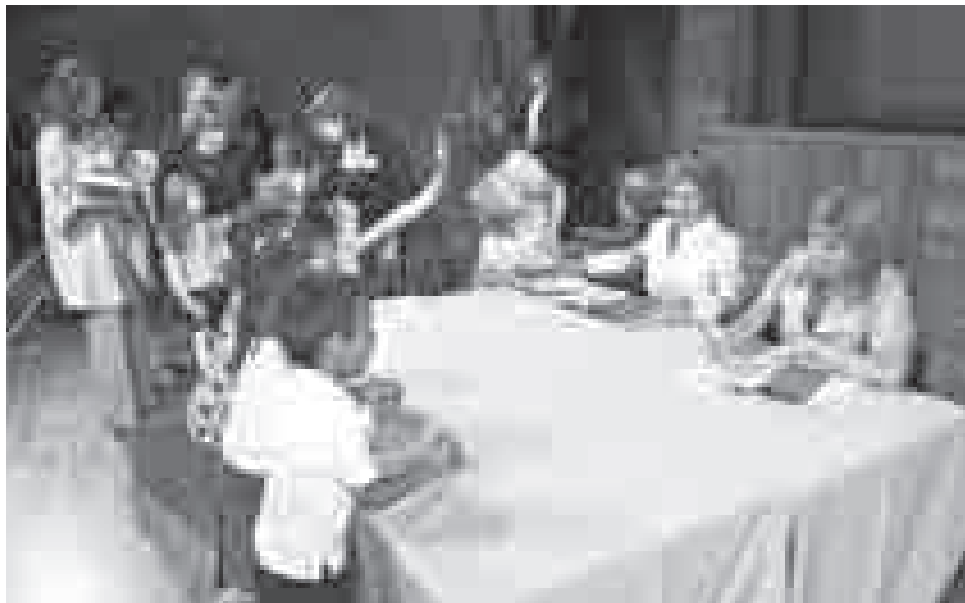
Second-graders from downtown Los Angeles' Esperanza Elementary School were among a capacity crowd who heard First Lady Laura Bush and daughter Jenna Bush Hager read from their new best-selling children's book, Read All About It , at the Los Angeles Public Library's Central Library May 22.