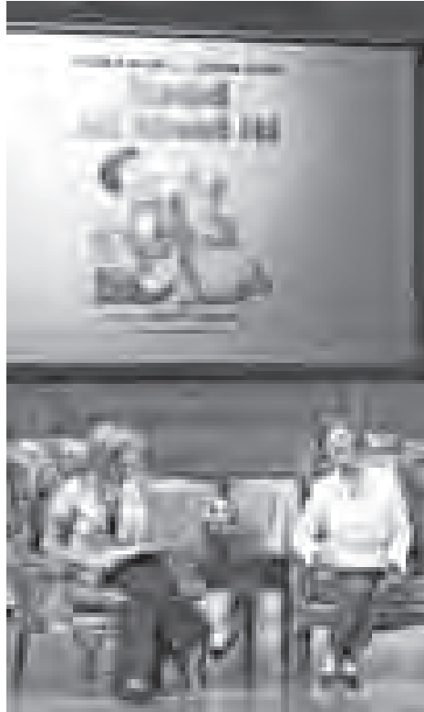
First Lady Laura Bush and daughter Jenna Bush Hager read from their book, Read All About It , in the Taper Auditorium at the Los Angeles Public Library.