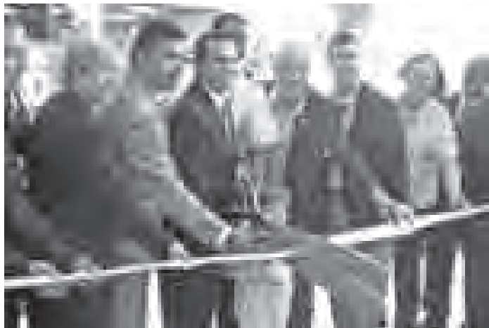
Dignitaries cut the ribbon.

To learn more about this and other Los Angeles Fire Department facilities modernized by Proposition F, please visit: lafd.org/propf.htm