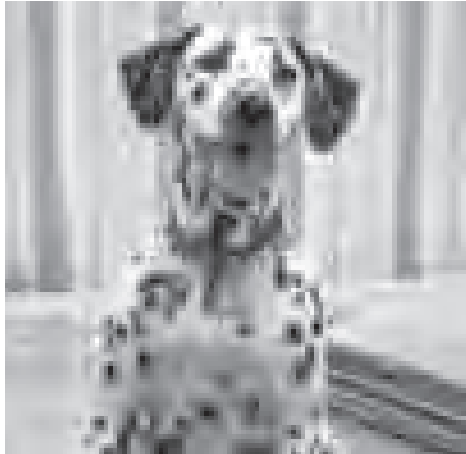
No Fire Station opening could be complete without a Dalmatian.

New Fire Dept. Air Operations facility at Van Nuys Airport celebrates its grand opening.