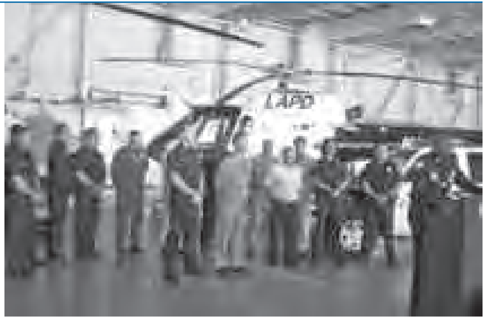
The opening ceremony.