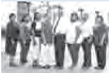
The Data Management Unit.

It is through the character and work ethic of the team members that we are able to exist as one of the most progressive, efficient and effective fire service providers in the nation. Data management group members have not only demonstrated their commitment to this department, but have shown a concern for its financial success.