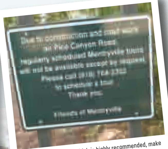
If you would like a tour, which is highly recommended, make sure you call (818) 768-2302.