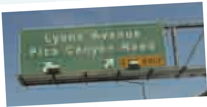
This is the sign you'll see off the 5 Freeway going north from Los Angeles.

but also shaded trails into the rugged and lushly vegetated headwaters of Pico Canyon and the Santa Susana Mountains. From Mentryville, the trail leads to Johnson Park at 0.7 miles, a serene picnicking spot once favored by the oil men who toiled in the fields, and the remains of the oil rig are another 0.7 miles up the canyon."