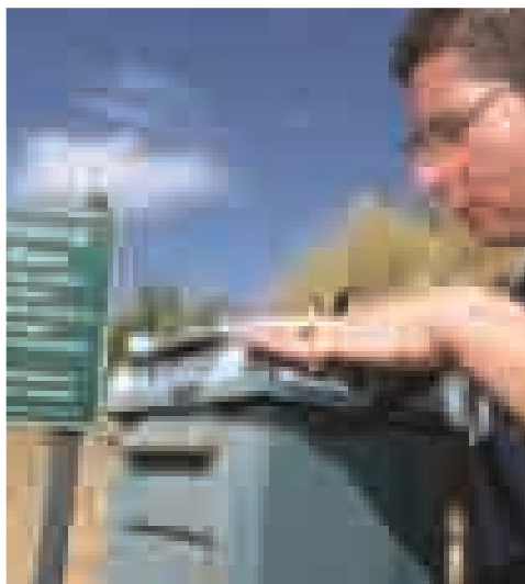
Make sure you pay the "Iron Ranger" as you enter Mentryville.

"Located at the end of Pico Canyon Road off of I-5 at Lyons, Mentryville is an 851-acre state park at the north end of the Santa Clarita Woodlands. The park has been operated