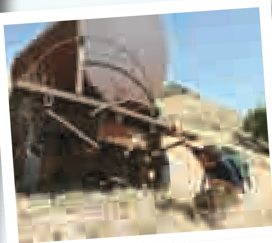
Here I am checking out an old tanker truck.

since 1995 by the Mountains Recreation and Conservation Authority, a joint-powers authority headed by the Santa Monica Mountains Conservancy. The City of Santa Clarita is a joint-powers partner. Mentryville offers hikers, bikers and equestrians not only a glimpse of California history,