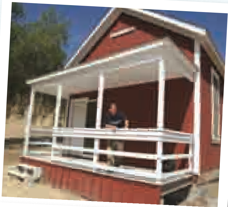
The Mentryville "one room" schoolhouse.