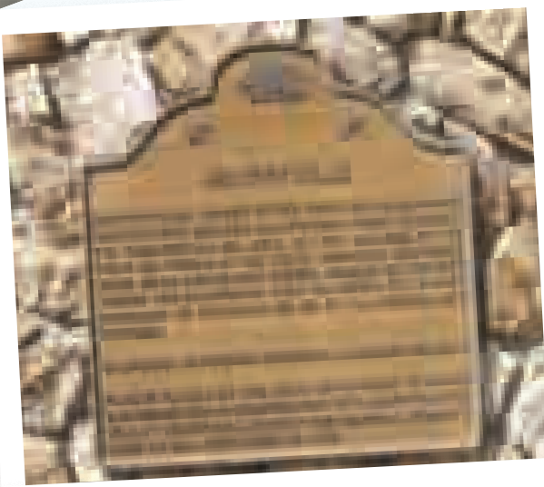
Mentryville's historical marker plaque.