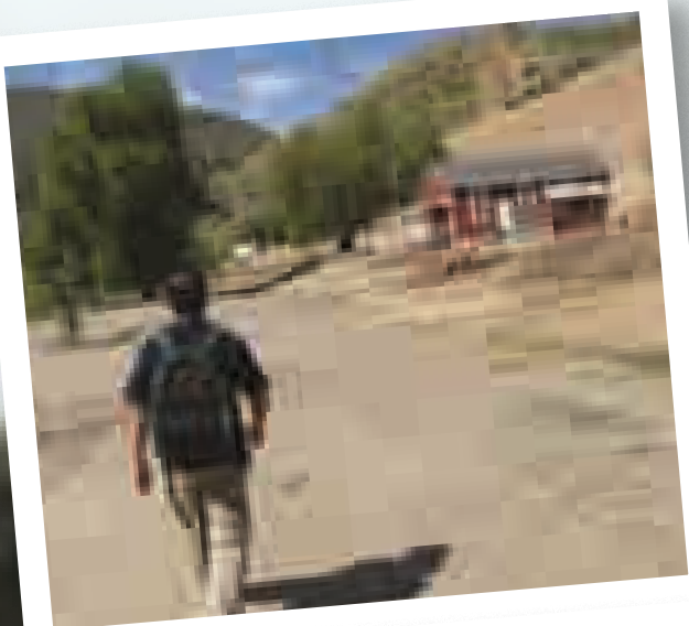
And here I go!