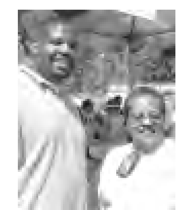
Ticket Guy with Club Rep Office of Accounting.