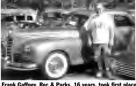
Nova II, and second place runner-up in the Original Restored Class with his 1946 Packard Clipper.