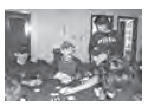
Are we having fun yet?!