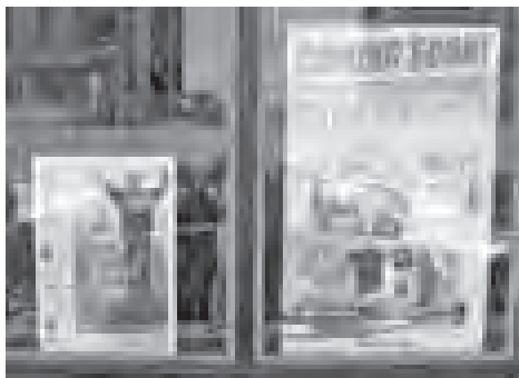
Pedestrians on Second Street might have seen these signs, telling of the new Club Store and Service Center.