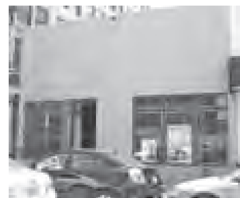
The new Club Store and Service Center is at 120 W. Second St. downtown.

Beautiful old building – reflecting that the Club has been around for more than 80 years – gets modern refurbishment just in time for opening May 1. Stop by to see the handiwork!