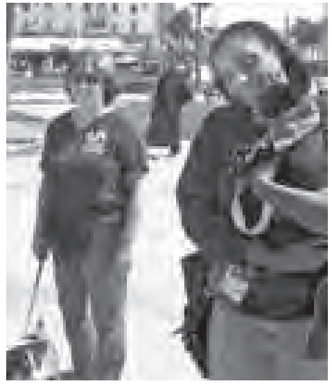
At the Animal Services mobile pet adoption event on Venice Beach April 6.

Animal Services teams up with national pet charity for pet adoption event on Venice Beach.