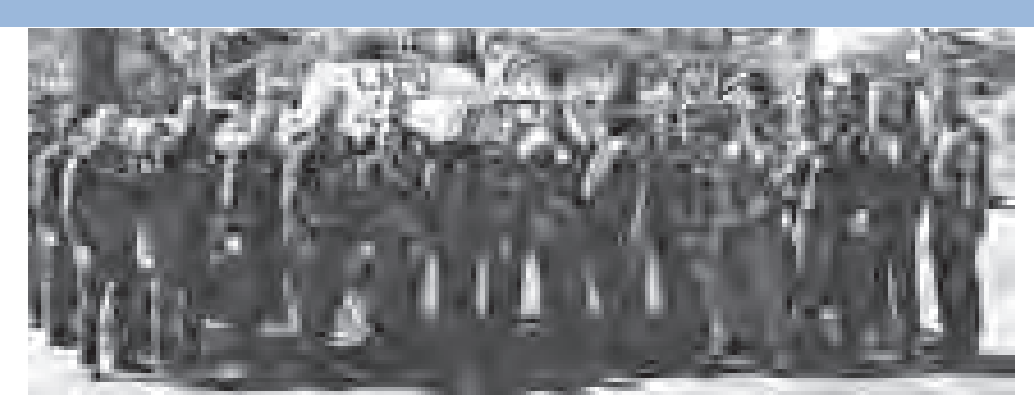
Some of the members of the LAPD Recruitment Division who, with Personnel, produced the event. Mayor Villaraigosa speaks to the group attending the morning VIP panel session.