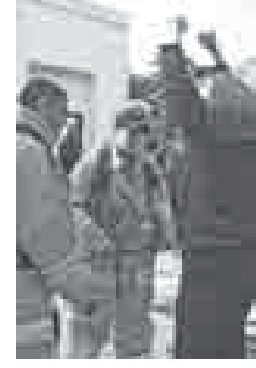
An LAFD recruiter helps an interested candidate put on the more than 60 pounds of equipment used every day in fighting fires.