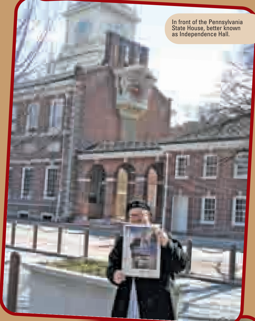
In front of the Pennsylvania State House, better known as Independence Hall.