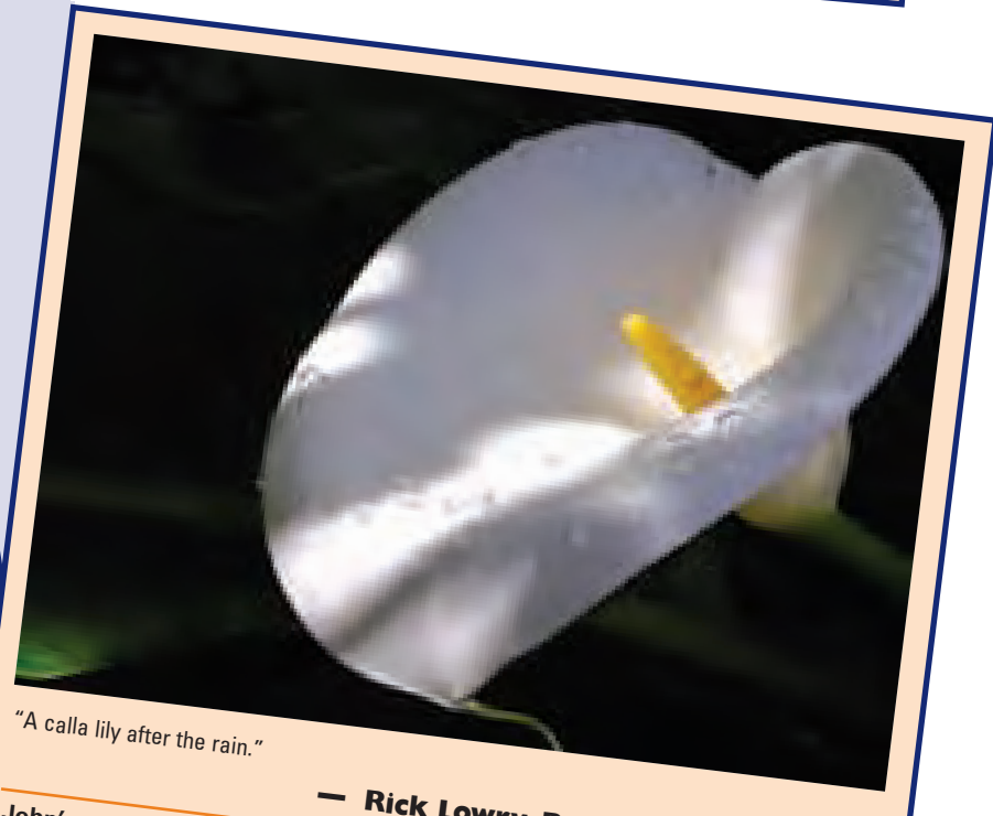
"A calla lily after the rain."