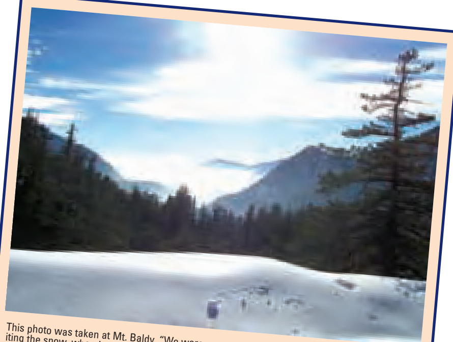
This photo was taken at Mt. Baldy. "We were on our way back down the mountains, after visiting the snow, when I spotted the picture perfect view. I couldn't resist, so I pulled over onto the side of the road and snapped this beautiful shot of the mountains peeking through the clouds."