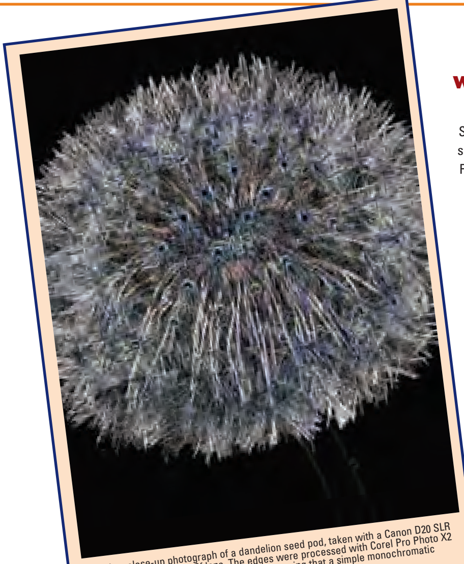
"This is a close-up photograph of a dandelion seed pod, taken with a Canon D20 SLR and a Sigma 28-70 MM/2.8f lens. The edges were processed with Corel Pro Photo X2 to give the photograph an artistic look. It's amazing that a simple monochromatic weed can look totally different with a few lighting changes."