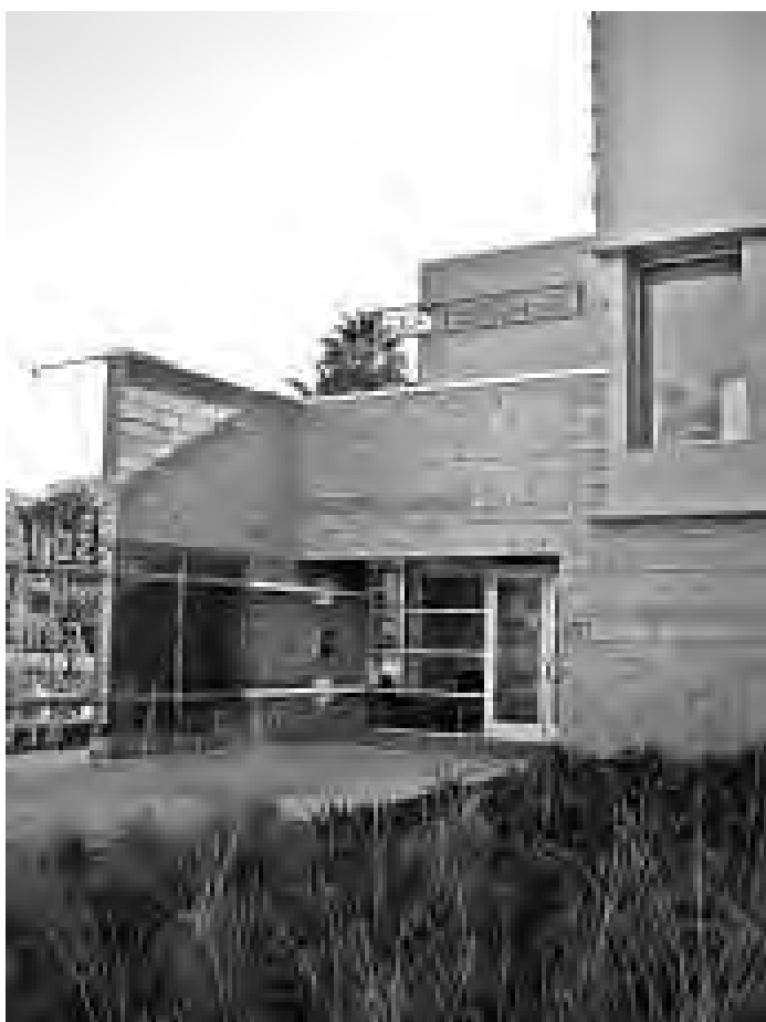
The new Fire Station 67, serving Playa Vista.