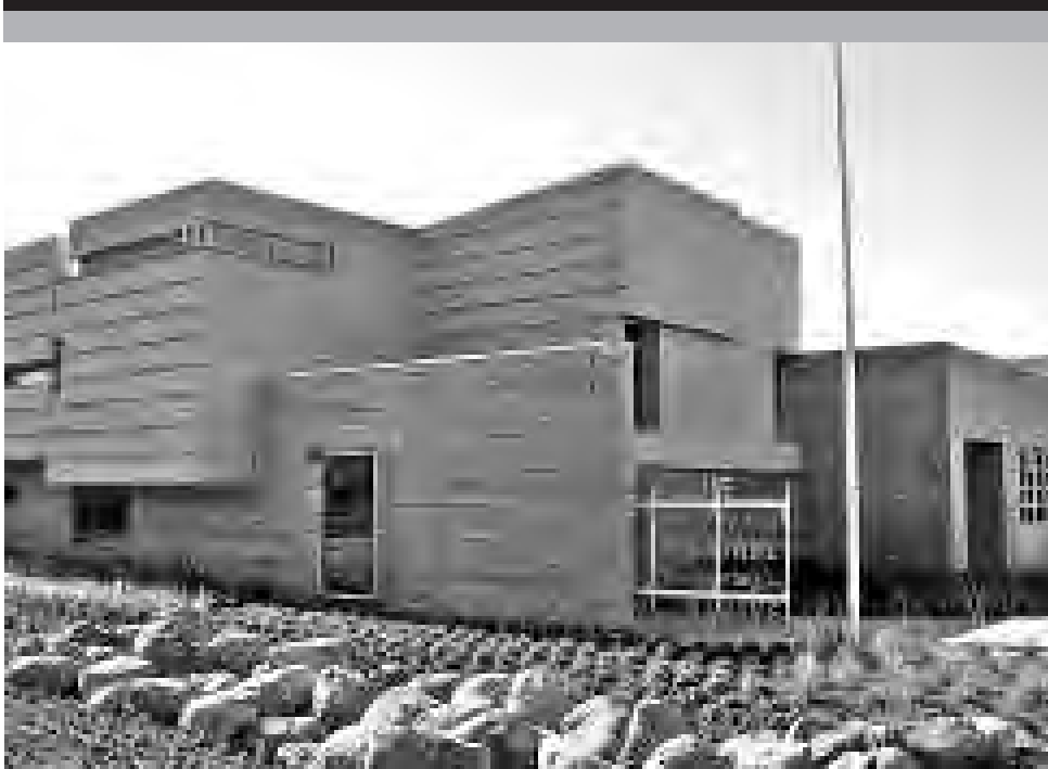
The new Fire Station 67, serving Playa Vista.