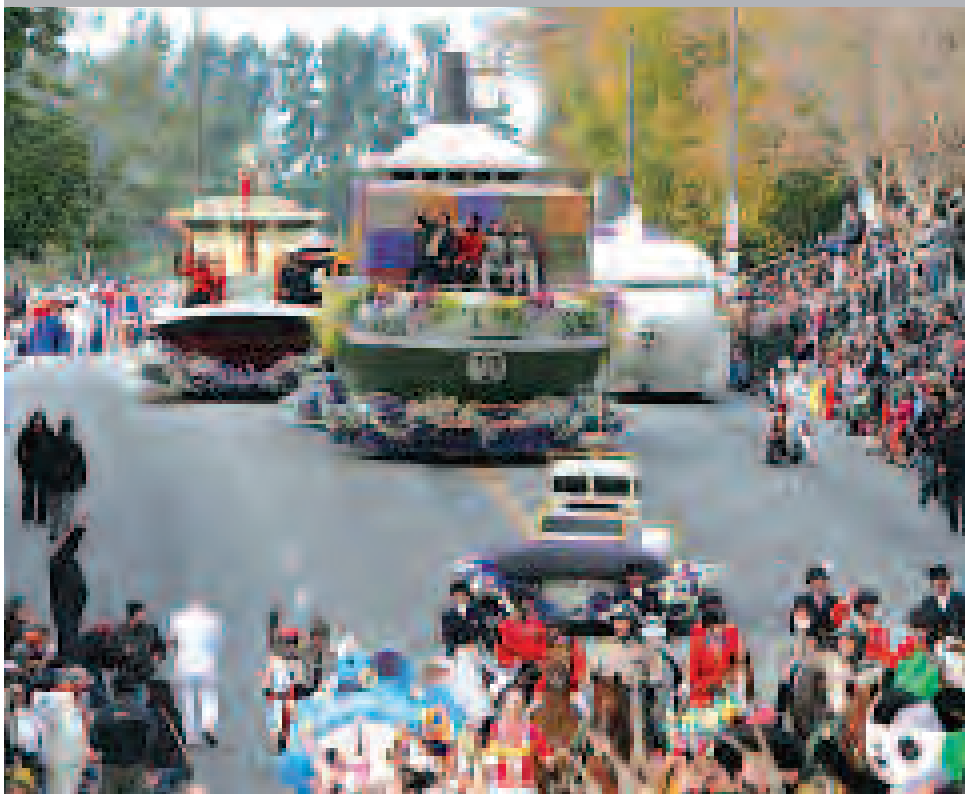
The many Harbor floats, that make up the City's official entry into the Rose Parade Jan. 1, make their way down Colorado Boulevard in Pasadena.