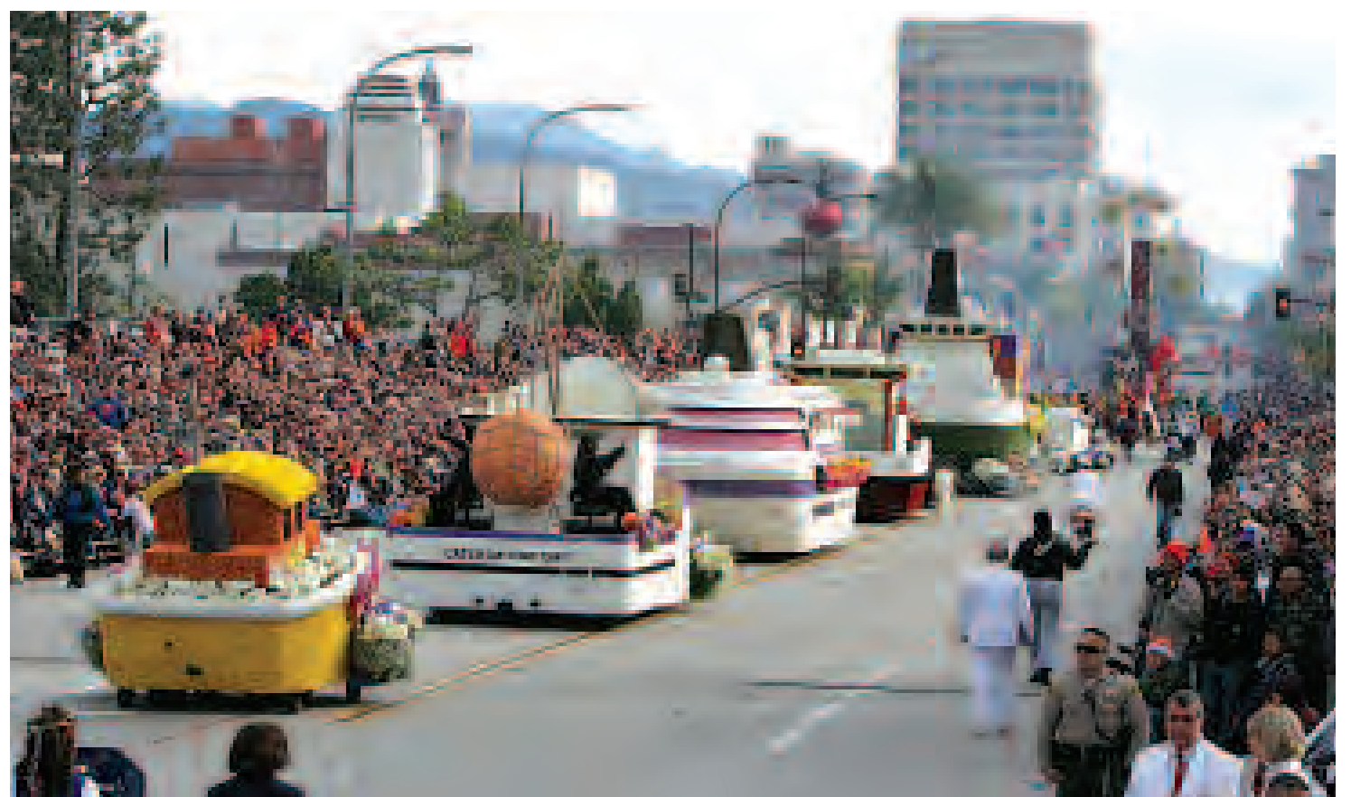
The many Harbor floats, that make up the City's official entry into the Rose Parade Jan. 1, make their way past their viewing stands along Colorado Boulevard in Pasadena.