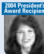
2004 President's Award Recipient