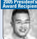
2005 President's Award Recipient