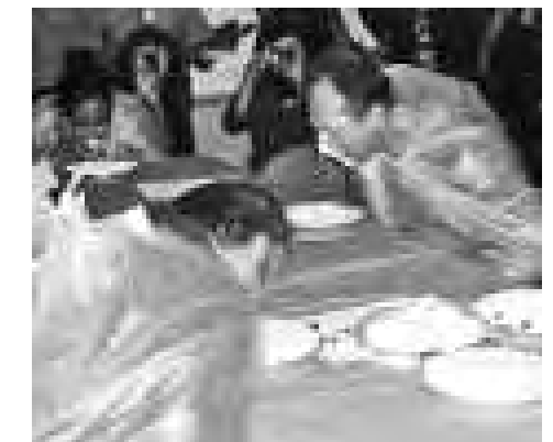
Airport employees get their faces dirty in the pie-eating contest.