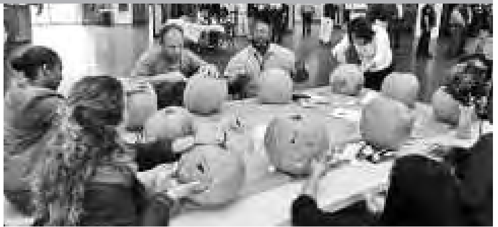
Employees participate in the pumpkin-carving contest.