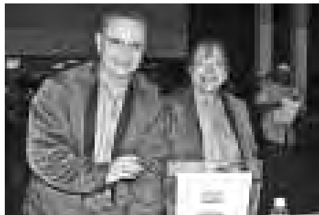
Two Ontario Airport employees participate in the raffle.