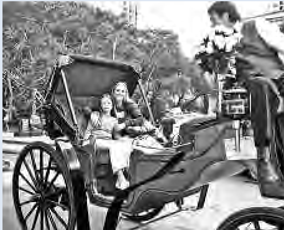
A carriage ride in Central Park.

room for a rollaway. I almost sleep-walked out of the room, but luckily mom woke me up in time and said, "Isabelle get back to bed," and I did.