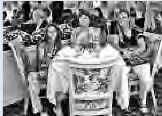
Having tea at the Tavern on the Green, on the Upper West Side of Manhattan.

was sad to leave New York City, but I was happy to see the rest of my family.