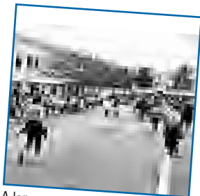
A large crowd of people participated in this great cause - fighting cancer.

Are you On the Move? Write to us and tell us what you're up to! It's even better if you send us a photo. We'll print what we can! talkback@cityemployeesclub.com