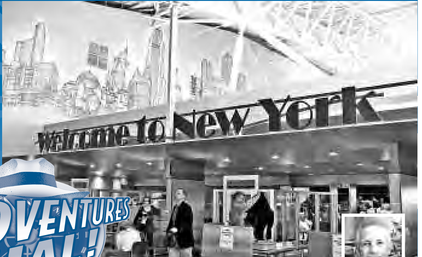
Arriving at John F. Kennedy Airport in New York.