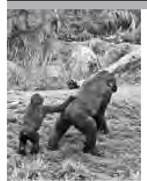
Inside the new Campo Gorilla Reserve.