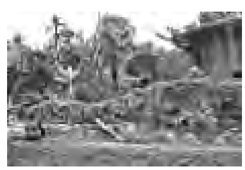
The new Campo Gorilla Reserve

time for gorillas in the wild, as they are facing the challenge of both habitat destruction and being hunted in the bush meat trade. Campo Gorilla Reserve will allow the L.A. Zoo to explain to our visitors why gorillas are endangered, what we can do to help them and instill in them the passion to care about these great apes."