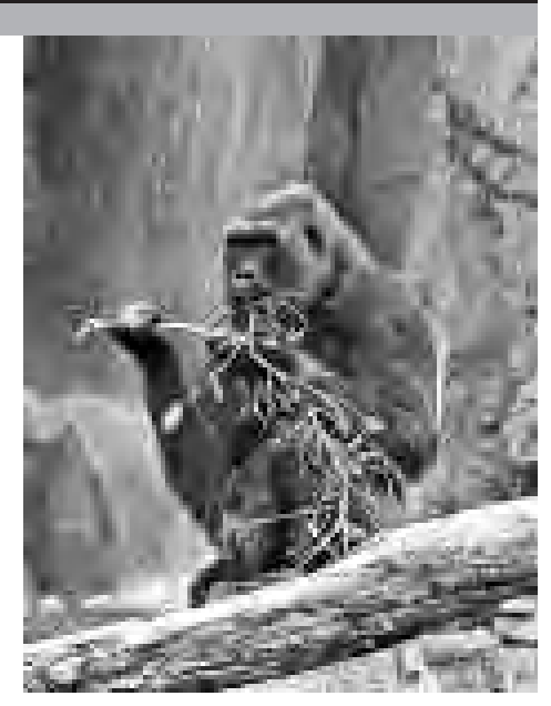
Inside the new Campo Gorilla Reserve

GLAZA's support for Campo Gorilla Reserve will continue well beyond its opening. GLAZAtrained docents will tour thousands of adults and children expected to visit the Reserve on a weekly basis. Also, a GLAZA-sponsored Discovery Cart at the exhibit, funded by the Flora L. Thornton Foundation, will be staffed by Los Angeles Zoo educators to enhance public understanding of gorillas.