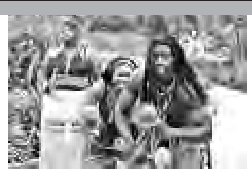
Ceremonies marked the attraction's opening

Campo Gorilla Reserve closely resembles the gorilla's native West Central African environment with trees, brush, flowers, waterfalls, climbing opportunities, a sunny grass area and a dark