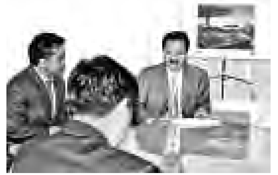
Delegates from China visited Engineering's Architecture Division to compare notes about green initiatives.