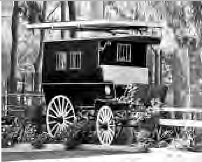
Prior to black-and-white cars, cops transported criminals on this wagon.