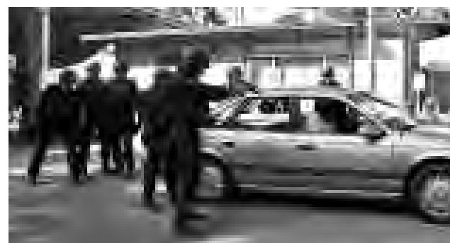
The SWAT demonstration had everyone on their toes.