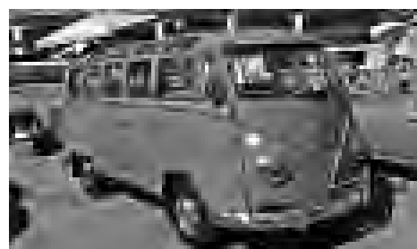
A 1965 Volkswagen Microbus, also known as the 21-window bus.