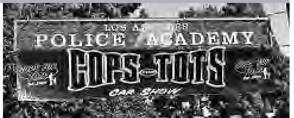
Welcome to the 12th annual Cops for Tots.