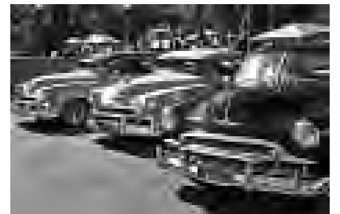
A group of Chevys dating from 1949-50.