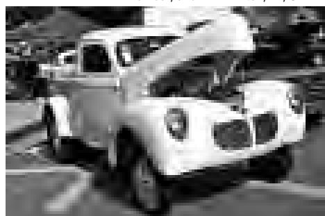
A 1940 Willys.