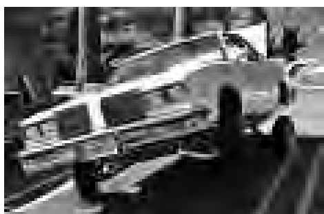
An Oldsmobile on its side.