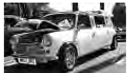
Mini Cooper Limo used a 1969 Austin Mini as a base for this project car.