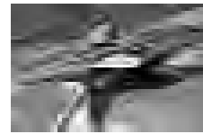
A 1954 Chevy hood ornament.