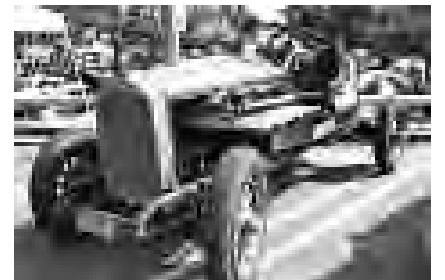
A 1924 Buick.