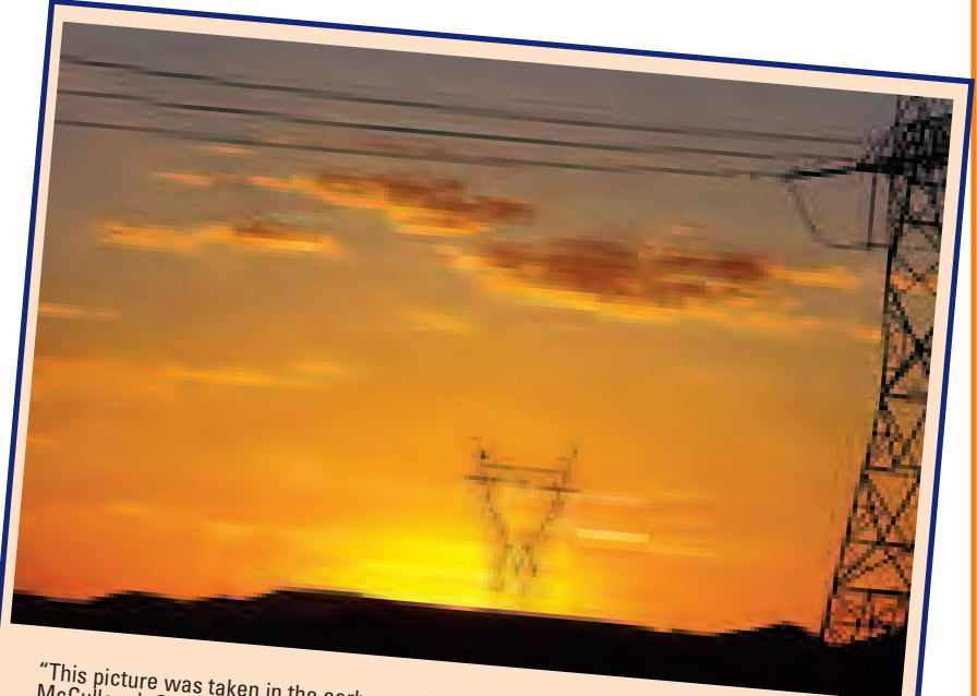
"This picture was taken in the early morning hours during some great sunrises at the McCullough Switching Station in Boulder City, Nevada."

NEXT DEADLINE: December 15 Happy Snapping!