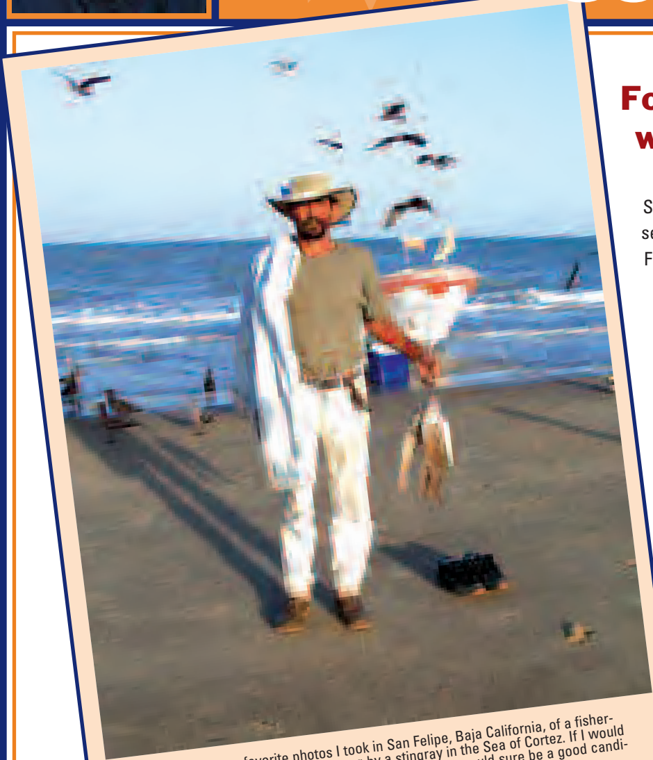
"This is one of my favorite photos I took in San Felipe, Baja California, of a fisherman, just one day after I had got stung by a stingray in the Sea of Cortez. If I would ever write a book of my travels in Mexico, this picture would sure be a good candidate for its cover."