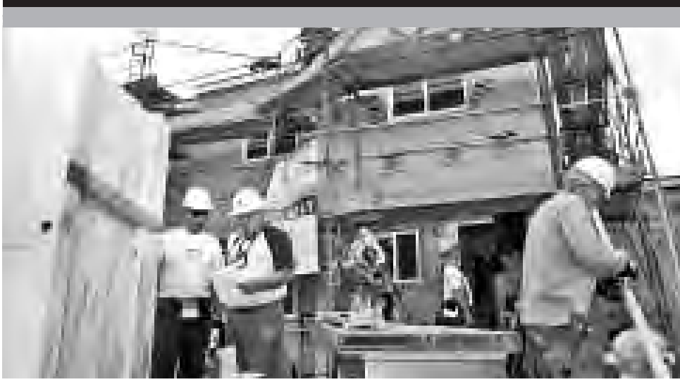
Volunteers construct the much-needed homes.