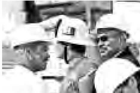
City Employees from various City departments volunteer their time at this Habitat for Humanity project.