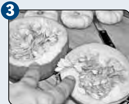
Step 3: Gut the pumpkin seeds and the rest of the inside material.