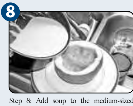
Step 8: Add soup to the medium-sized pumpkin that was hallowed out; sprinkle finely chopped chives over the soup, and place the lid on the pumpkin to keep it warm.