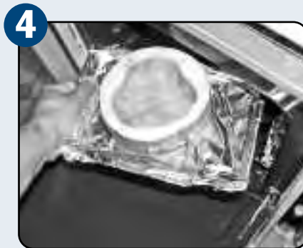
Step 4: Place the cleaned pumpkin on a baking sheet and put in the oven on broil for about 10 minutes or until the inside of the pumpkin has dried out.