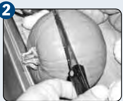
Step 2: Cut the pumpkin toward the stem side so that you can later use the cut piece as a lid.