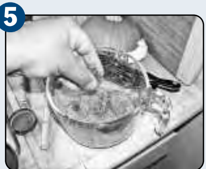
Step 5: Open the can of mashed pumpkin and place the contents in a bowl. Add the parsley, pepper and salt.