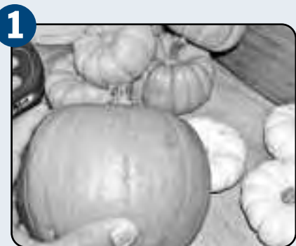
Step 1: Select a medium-size pumpkin for use as a decorative soup bowl.