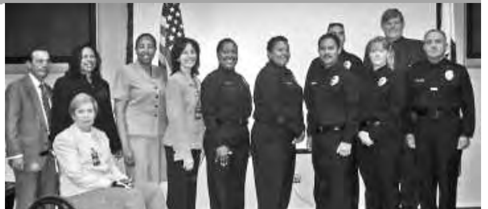
The graduation class.