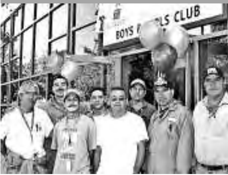
Harbor Gardner Crew, Div. 137, standing in front of the Health Fair sign