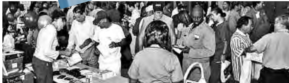
The Health Fair crowd in the Harbor Boys and Girls Club gymnasium.