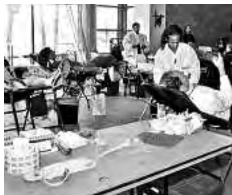
Employees give blood.