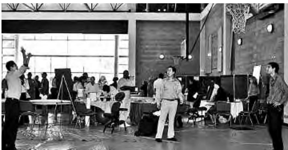
Harbor employees played basketball for prizes.