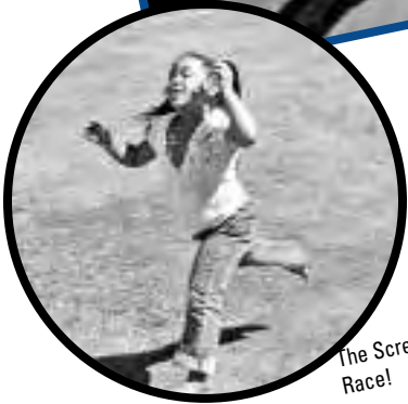
The Screaming Race!