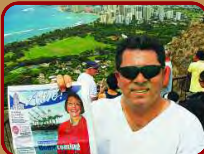
"Aloha! This is from the observation platform at the top of Hawaii's Diamond Head Crater, right