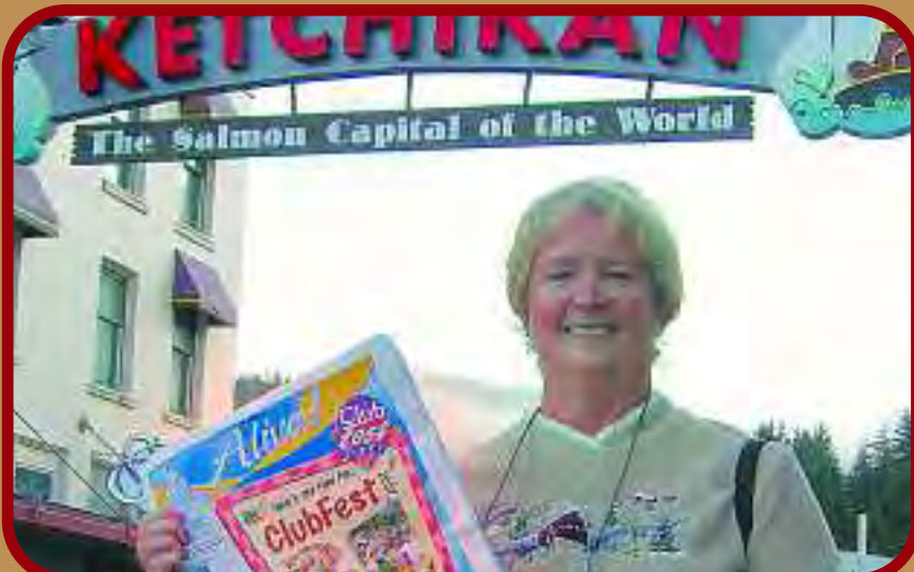
"This picture is from a cruise Ron and I took to Alaska. We saw beautiful humpback whales, eagles and wild seals and otters swimming in the ocean. On our stop pictured here in Ketchikan, we shipped home a case of wild Alaskan salmon to enjoy later with friends and family. Alaska was truly spectacular!"