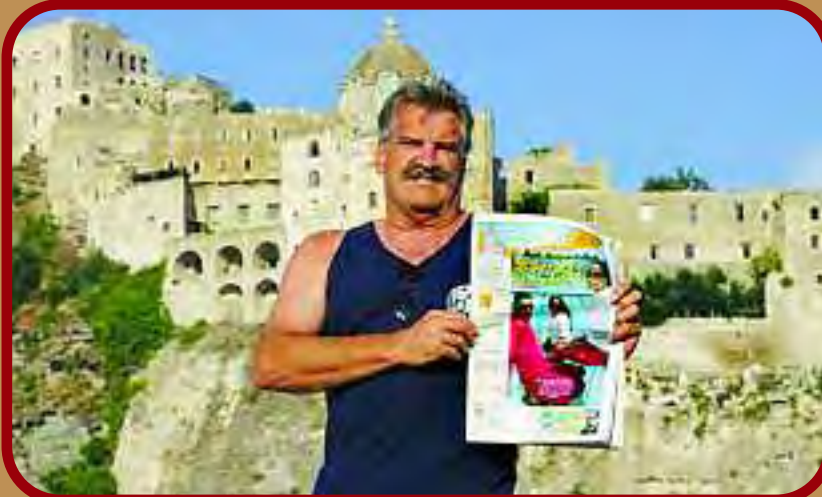
"This photo was taken on our trip to Ischia, Italy, in July for the Feast of St. Anne. Ischia is one of the sister cities to Los Angeles. My lady friend was born on Ischia (an island in the Bay of Naples, close to the Isle of Capri) and lived about 100 yards from this castle until she came to America when she was eight years old. This castle used to be her playground."