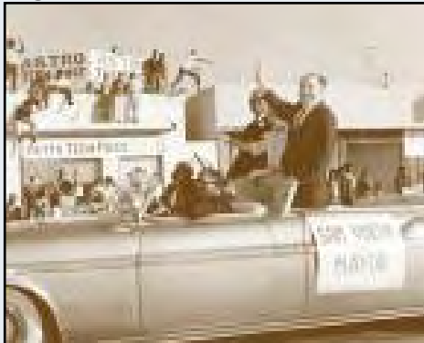
Then-mayor Sam Yorty rides in City's parade car, 1967.