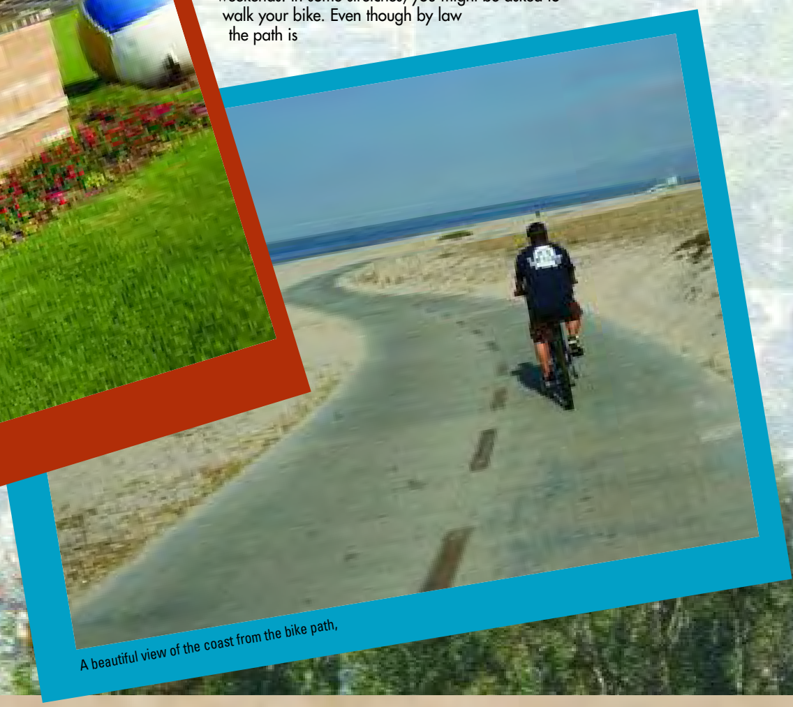
A beautiful view of the coast from the bike path.