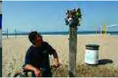
Interesting art on a pole.