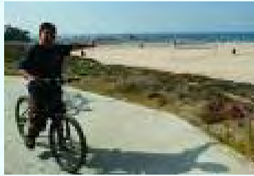
El Segundo beach volleyball courts.