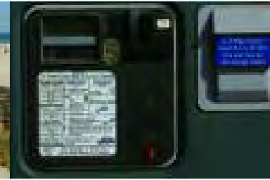
The meter with summer rates.