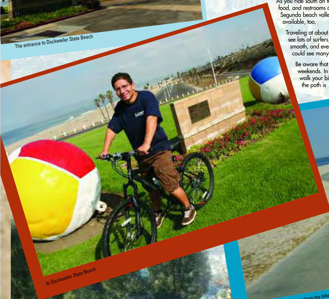
At Dockweiler State Beach.