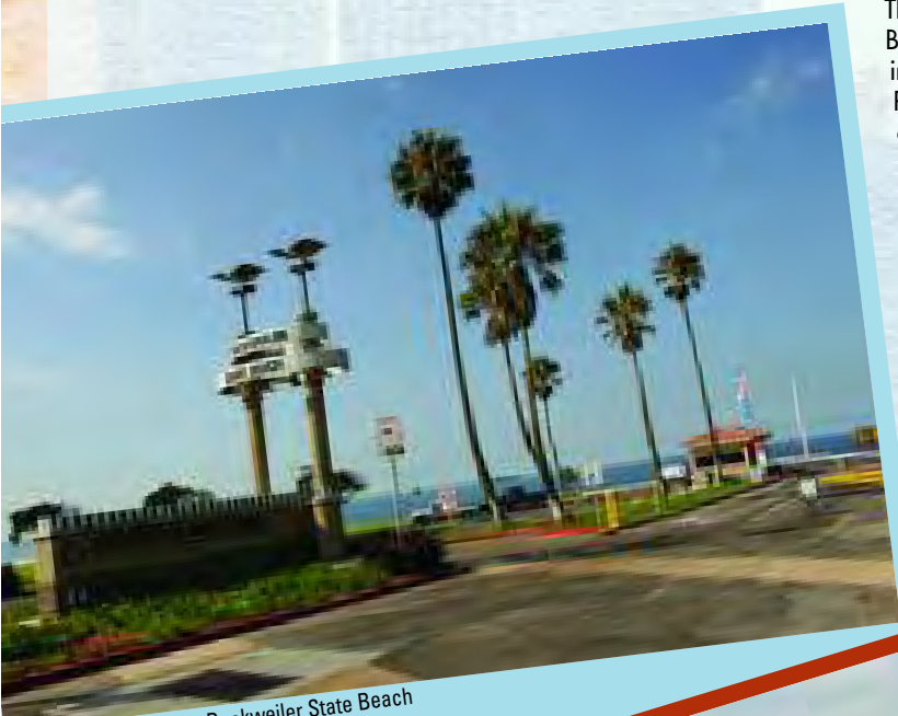
The entrance to Dockweiler State Beach

Be aware that the bike path can be a very busy place, especially on weekends. In some stretches, you might be asked to walk your bike. Even though by law the path is