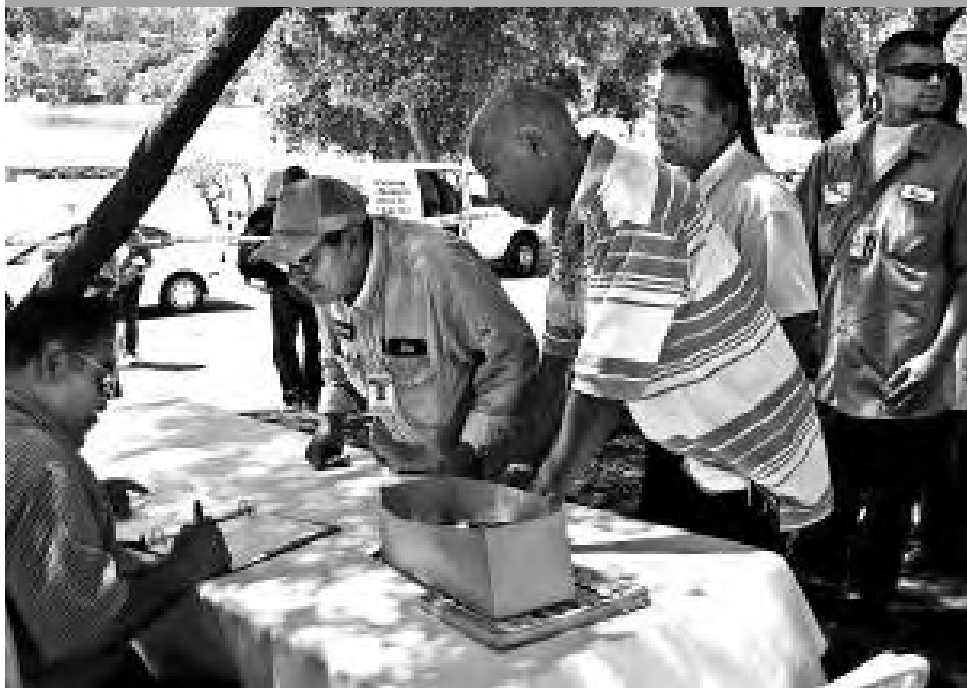
Employees wait to receive their complimentary Emergency Preparedness Kits.