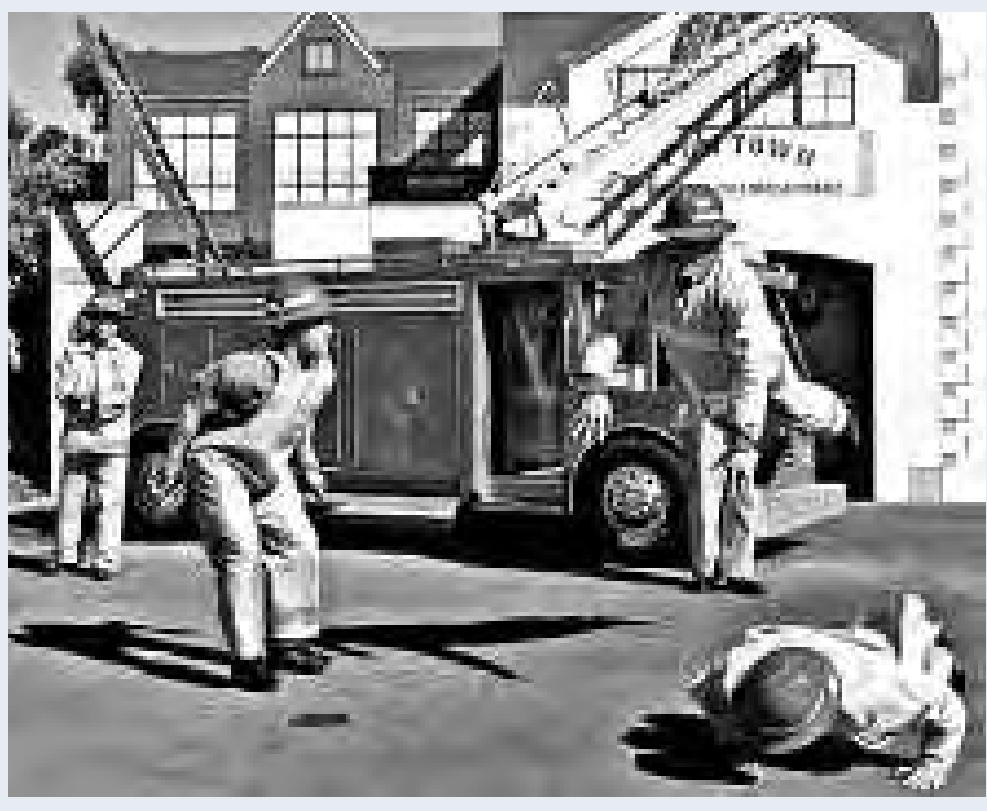
The fire show at Legoland.

Royal Joust. The kids also enjoyed the Hideaway, which was like a big tree house and slide area for kids. It took us about two hours to see the two areas, and it was time for lunch and we ate at the Garden Restaurant, which offered a nice selection of sandwiches and pizza. The prices were on par with other theme parks, but I felt the service inside the park was not up to the standards of