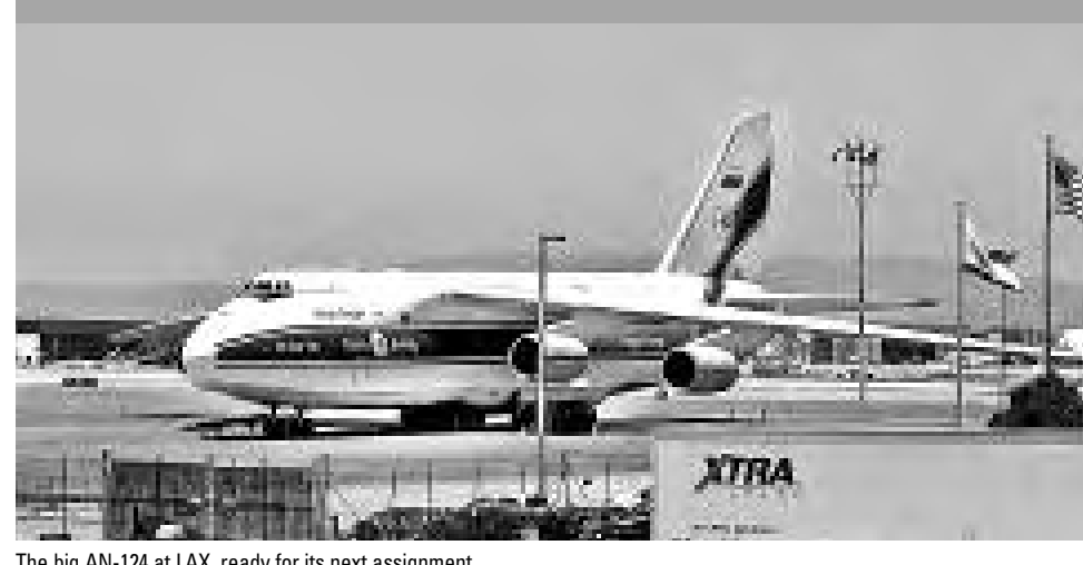
The big AN-124 at LAX, ready for its next assignment.

For More Information and Entry Form Contact: Mark Pineda (760) 701-1417 cell or (760) 868-5131 home