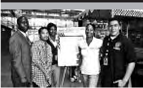
Some of the Transportation employees who helped organized the event.