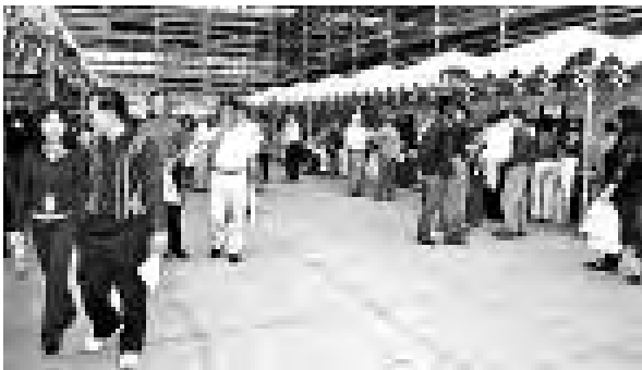
Many came to take advantage of the many free services available.