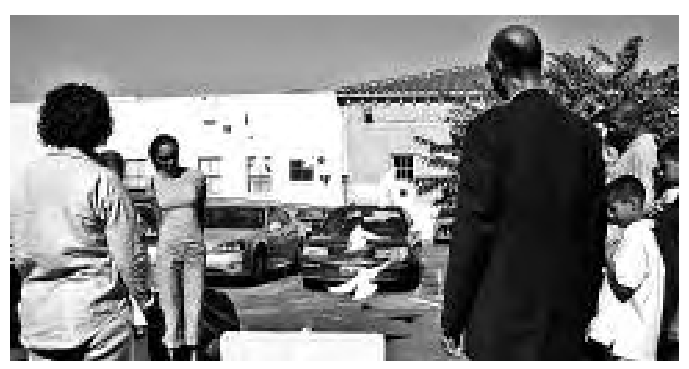
The family releases doves at the ceremony.

The classroom will serve as a haven for youths