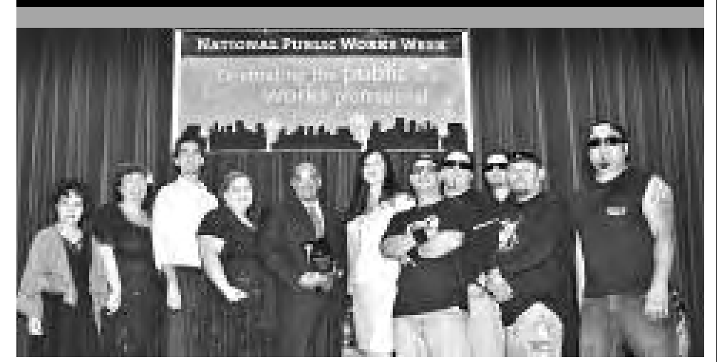
The talent show contestants gather on stage.