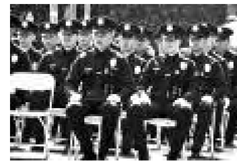
Graduates wait to be dismissed for the last time