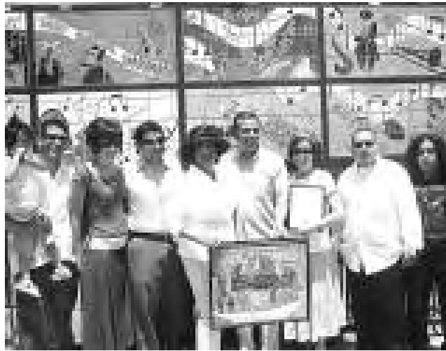
Kicking off last year's jazz festival were, among others, Councilwoman Jan Perry, Club Member, and Mayor Antonio Villaraigosa.